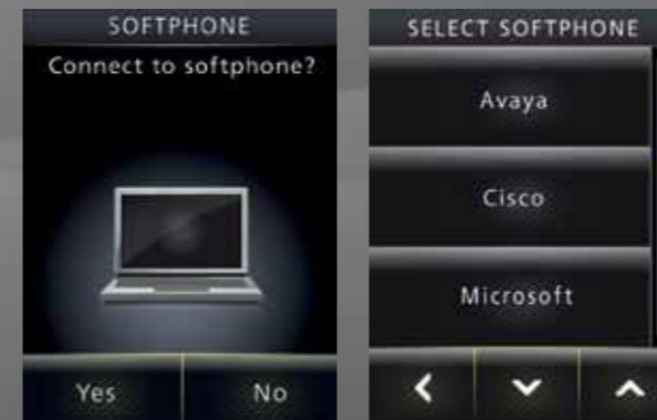
SETTING UP THE HEADSET