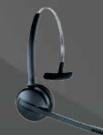
Jabra PRO 9450

Jabra PRO™ 9400 Series headsets' stylish, discreet design is adaptable for different wearing styles that ensure a perfect fit all day long. As Unified Communications becomes the norm, users will be wearing their headsets for longer periods, making comfort more important than ever. Choose between a headband, neckband or try the unique Jabra earhook. All wearing styles allow for easy adjustment for use on the left or right ear.