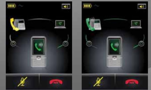
MERGING A CALL

It's easy to get started, too. A SmartSetup wizard on the touch screen guides you through the simple process of connecting phones and choosing preferences to get you started in minutes. Once you're up and running, the screen's colorful icons and intuitive menu system make call-handling a breeze.