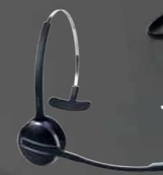
Jabra PRO 9450 Flex/ Jabra PRO 9460 Flex