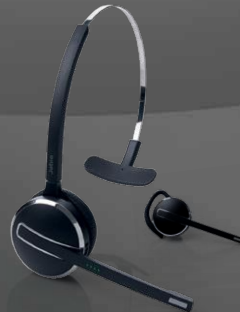
Jabra PRO™ 9470