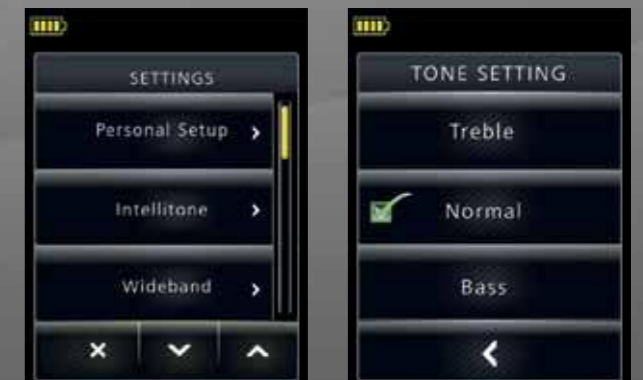
PERSONALIZING THE HEADSET