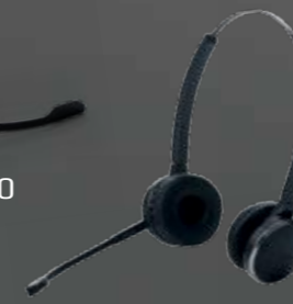
Jabra PRO™ 9450 Duo/ Jabra PRO™ 9465 Duo/ Jabra PRO™ 9460 Duo