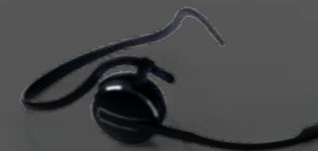
Jabra PRO™ 9460